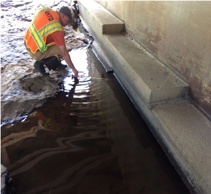
PHOTO 1 Description Bent 1 minor voids under edge of footing.